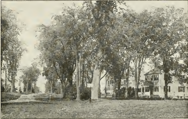
Windham Hill, Maine

tered in the cemetery adjoining the meeting-house, in which he had so long broken the bread of life, and the people of this town have reason to be thankful, not only for his life, but that the dust of this eminent servant of God is sleeping in its bosom.